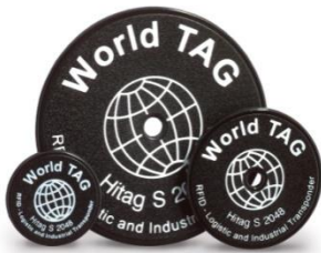
World Tag Family

The World Tag family is a set of disc shaped transponders that are suited for low cost indoor office use applications. Like IN Tags, they are available in 20, 30 or 50mm diameter with various chip options in LF. This kit contains a World Tag 30mm in LF (Unique chip).