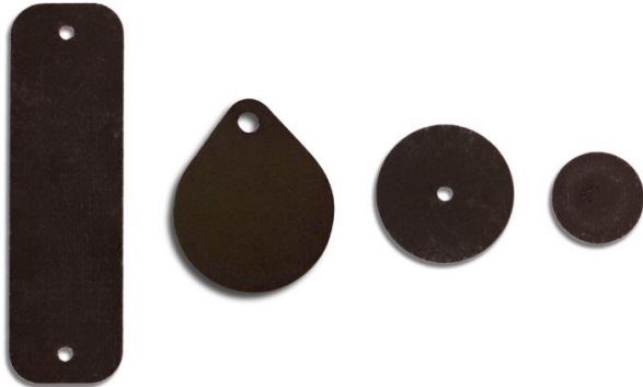
Epoxy Tag Family

Epoxy discs are thin, printable and available in different diameters for LF and HF. Epoxy discs are often used in light duty industrial applications. This kit contains an Epoxy Tag UHF (rectangular shape).