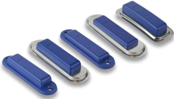
InLine Tag™ Ultra Family

The InLine Tag Ultra family is a set of highly robust general purpose UHF hard tags, with multiple fixation options, worldwide UHF broadband capability and excellent performance. Two members of the InLine Tag Ultra family are enclosed, the InLine Tag Ultra and the InLine Tag Ultra Slim Weld (thinner with metal ring).