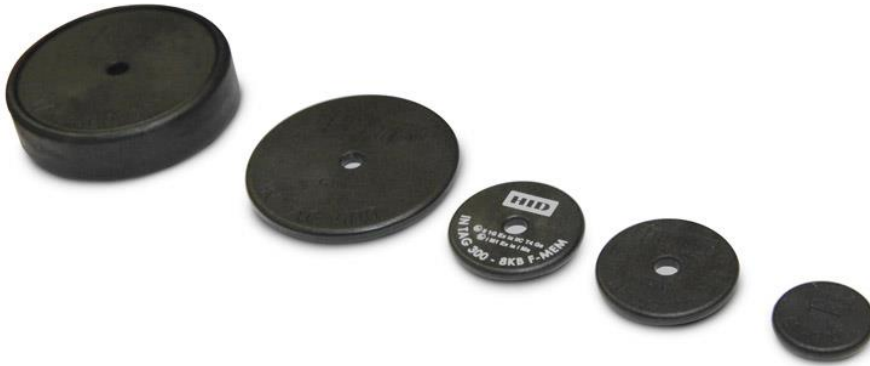
IN Tag family

IN Tag transponders are available in 20, 30 or 50mm diameter with various chip options in LF and HF frequencies. IN Tag 200 and 500 are also available in on-metal versions. This kit contains an IN Tag 300 HF (iCODE SLiX).