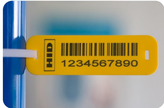
SlimFlex Tag Standard-200