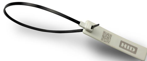
SlimFlex SealTag Mini (integrated cable tie)