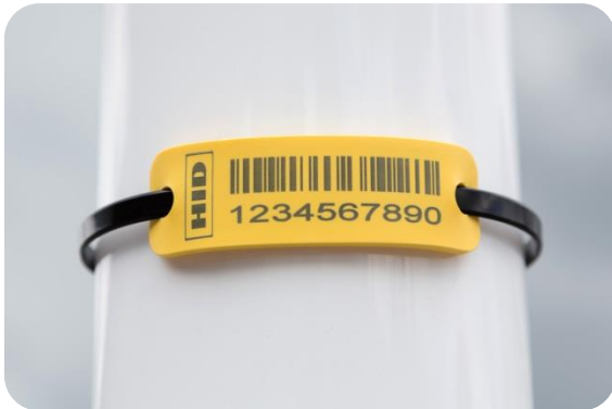
SlimFlex Tag Standard-301

The SlimFlex Tag family are broadband UHF tags are highly durable and flexible. These tags are ideal for rugged, outdoor use on irregular surfaces. Two members of the SlimFlex Tag family are included in the kit, the SlimFlex Tag Standard-200 and the SlimFlex Tag Mini .