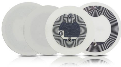
NFC Inlays &amp; Labels with NTAG 213 – NFC Forum tag type 2 chip

Inlays are available in form of transparent wet inlays or as printable labels in rolls of 2.000 pcs. These form factors are available NTAG 213 chip (NFC Forum tag type 2) or HID Trusted Tag® (NFC Forum tag type 4) for use cases that need secure authentication or more memory. This kit contains a 40 mm NTAG 213 wet inlay .