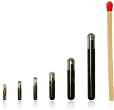
Glass Tag Family