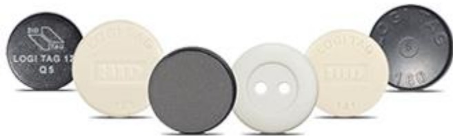
Logi Tag Family

The LogiTag family is a set of small disc shaped transponders that are optimized for high robustness. Mainly used for industrial laundry or medical applications, Logi Tag's small form factor paired with excellent environmental resistance and an ATEX certification for explosive or mining environments make them ideal for other industrial item tagging applications as well. This kit contains a Logi Tag 121 on-metal (Vigo™ Chip), a LogiTag 161 and Logi Tag Button 162 HF (iCODE SLix) for Laundry applications.