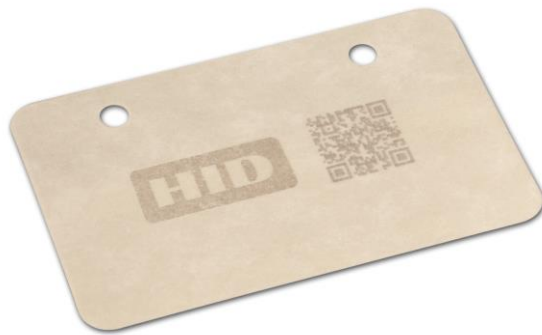
HID High-Temperature Label UHF

This thin and flexible label is flame resistant and meant to survive the high temperatures of paint-shop processes during automotive production processes. The label can be manufactured in custom shapes and be laser engraved with graphic or text for optical recognition.