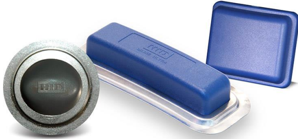
Keg Tag LF InLine Ultra Curve Keg Tag UHF

The keg tag family is a set of on-metal hard tags designed to fit on steel kegs, gas bottles etc. to track their lifecycle and endure the harsh treatment of kegs and tags along the way. This kit contains the Keg Tag UHF which is meant to be glued on metallic items like gas cylinders.